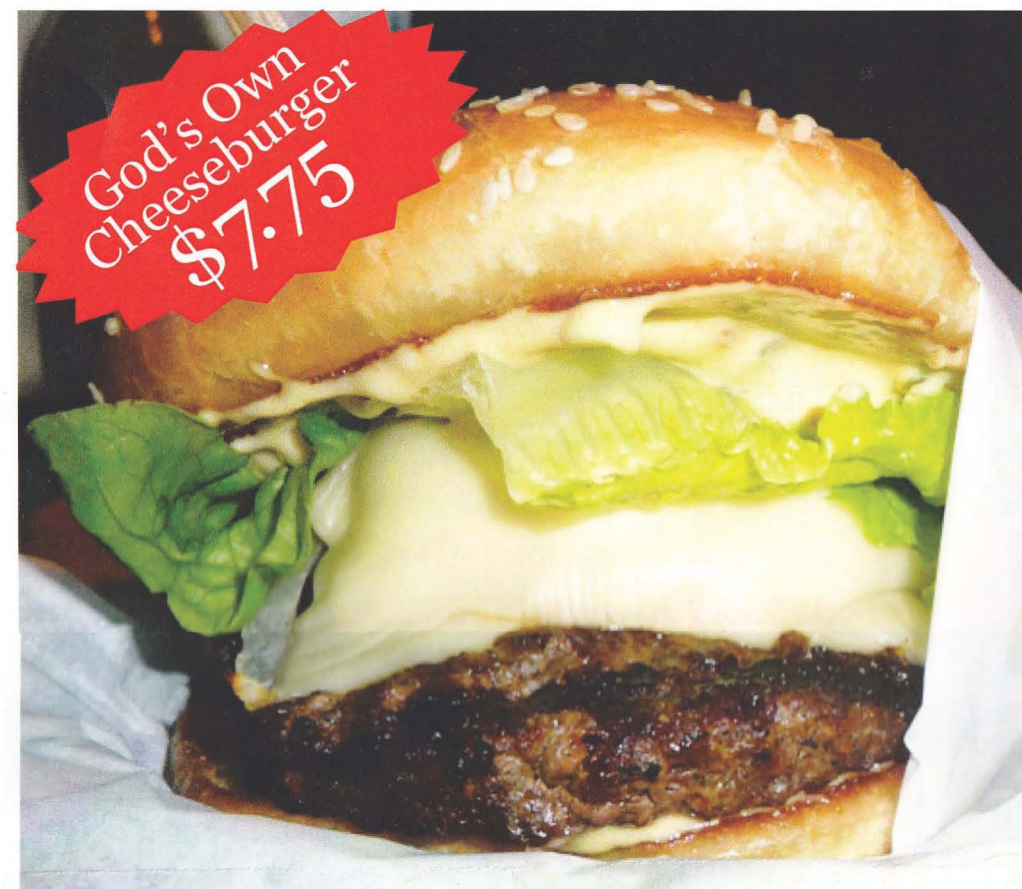
God's Own Cheeseburger $7.75 Our Original Burger with Swiss cheese

All of our burgers are cooked to order, 1/3lb. 100% quality beef, basted in butter, minced garlic and Worcestershire sauce. They are served on a sesame seed bun with Thousand Island dressing, lettuce, tomato, onions, and a bag of chips with a pickle on the side.