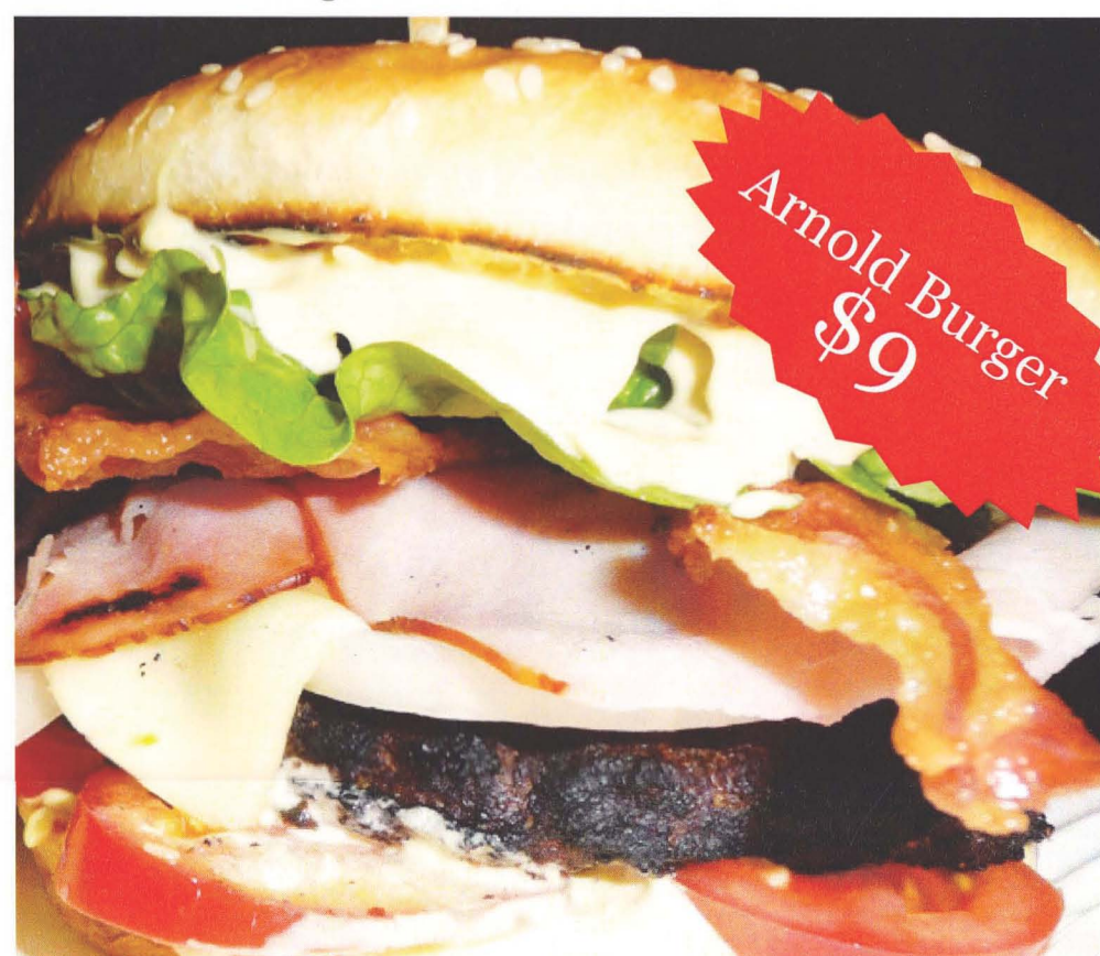
Arnold Burger $9 Ham, Bacon & Swiss Cheese