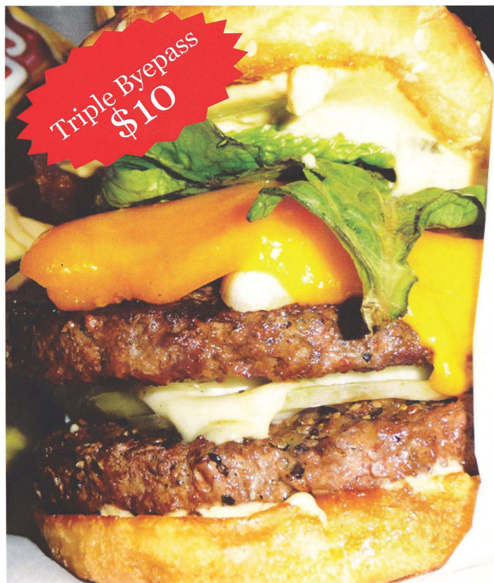
Triple Bypass $10 Our Monster. Two 1/3lb. patties w/ all the trimmings. Meet the "Triple Bypass Challenge" and win $200!