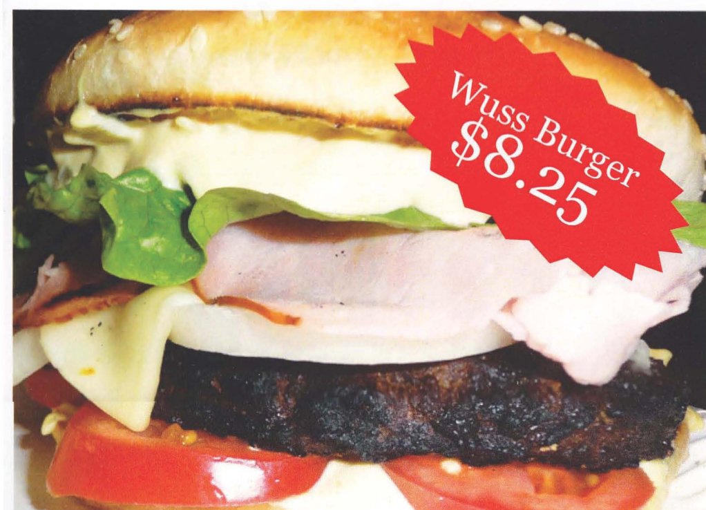
Wuss Burger $8.25 Our Original Burger with Ham & Swiss Cheese